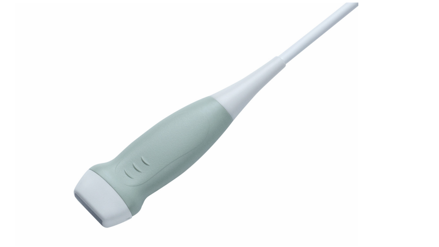
Figure 1. Small Footprint Cardiac Transducer Type 8837.

Small Footprint Cardiac Transducer Type 8837 is designed for basic cardiac examinations, abdominal imaging and transcranial imaging.